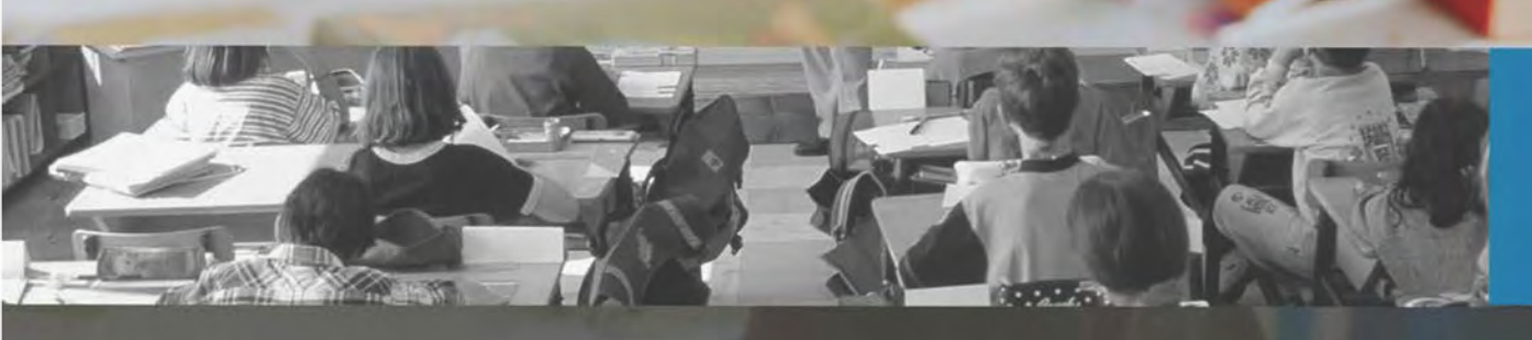
TABLE OF REFERENCES FOR PARENTS AND GUARDIANS