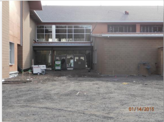
North side Entry