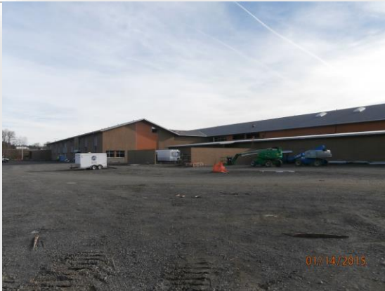
West end of North Classroom Wing