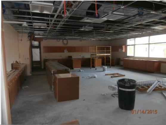
Typical Science Classroom