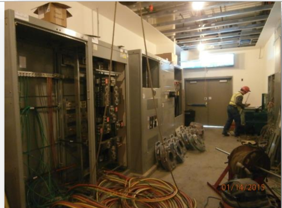
Main Electrical Room