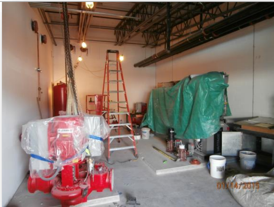
Fire Sprinkler Riser Room