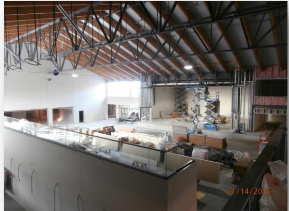
Commons from 2 nd Floor Concourse