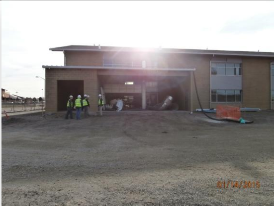
East end of North Classroom Wing