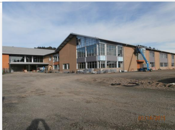
West end of South Classroom Wing/Library & Admin.