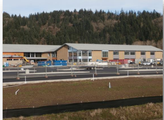
View from Dike Access Road