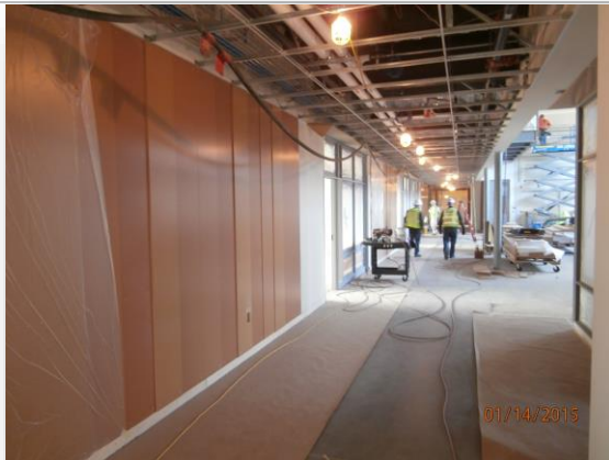
North Classroom Wing corridor