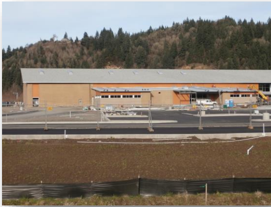
View from Dike Access Road

Additional photos available via web camera access: www.dwpwebcams.com/whs/desktop.htm