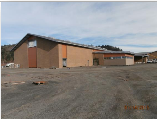
Gymnasiums from west