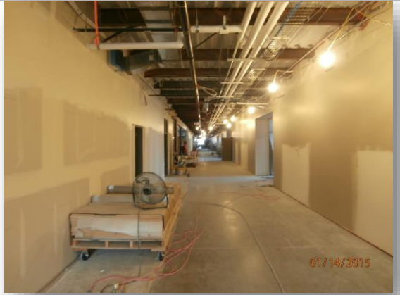
Lower Concourse looking north