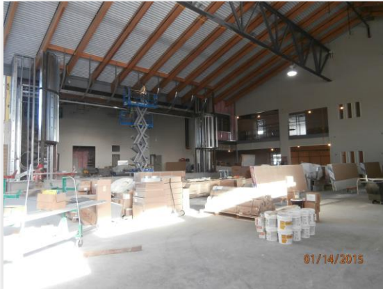
Commons looking east