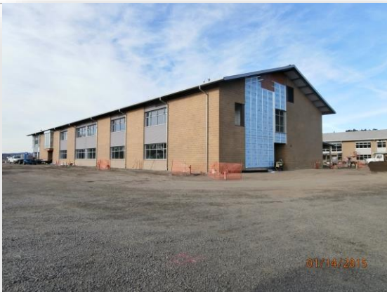
East end of South Classroom Wing