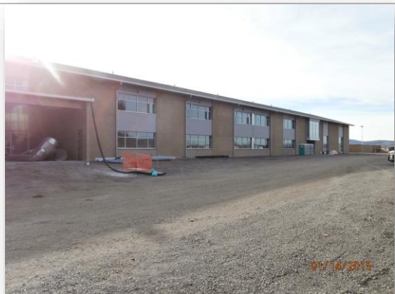
North side of North Classroom Wing