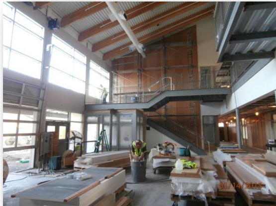
Shared Activity area South Classroom Wing