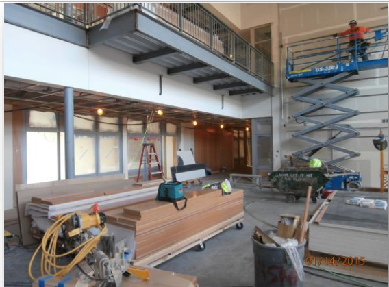
North Classroom Wing Shared Activity