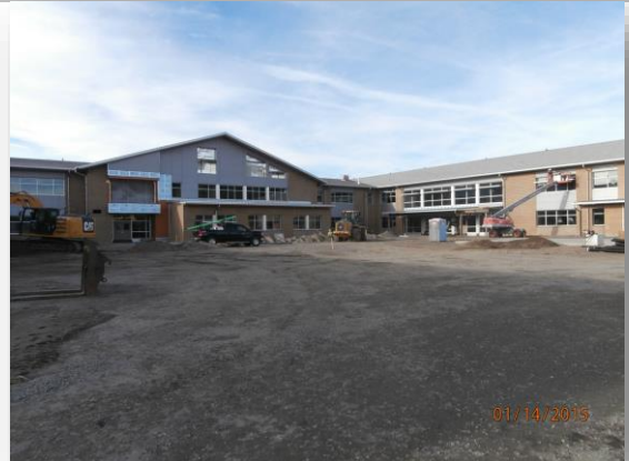
Courtyard looking west