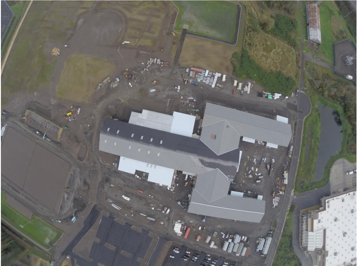
Aerial view 10.24.2014